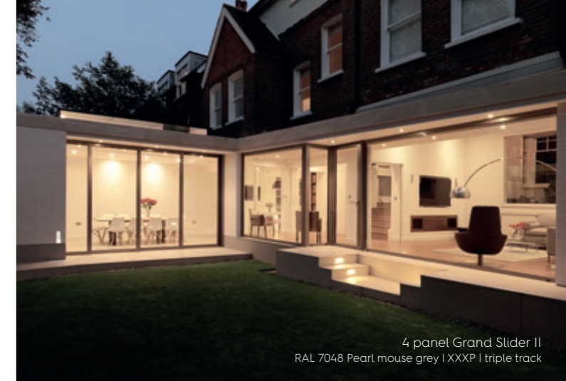
4 panel Grand Slider II RAL 7048 Pearl mouse grey | XXXP | triple track