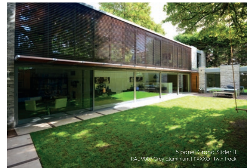
5 panel Grand Slider II RAL 9007 Grey aluminium | PXXXX | twin track