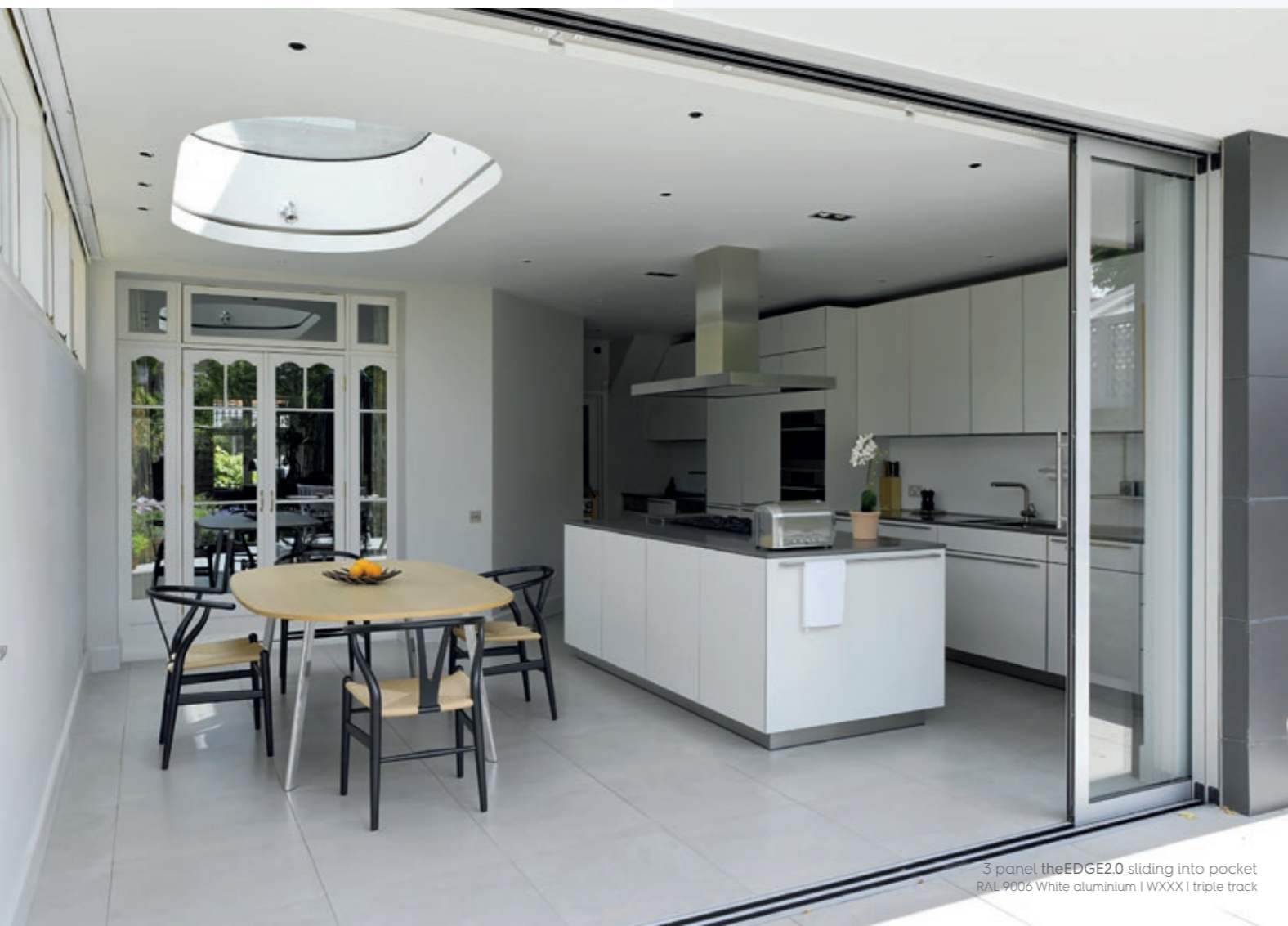
3 panel theEDGE2.0 sliding into pocket RAL 9006 White aluminium | WXXX | triple track