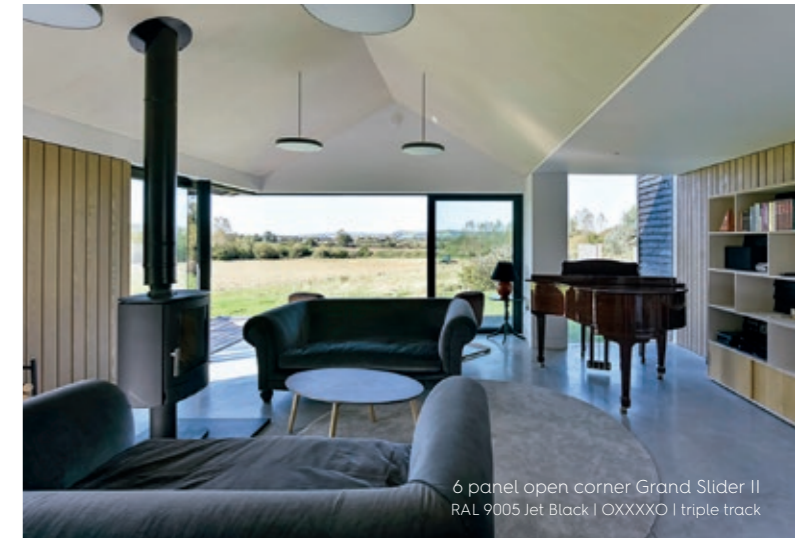
6 panel open corner Grand Slider II RAL 9005 Jet Black | OXXXXO | triple track