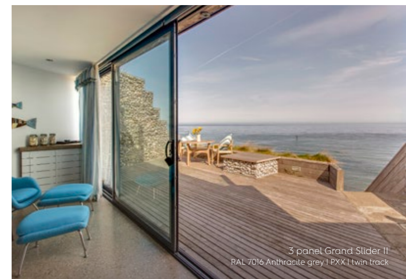
3 panel Grand Slider II RAL 7016 Anthracite grey | PXX | twin track