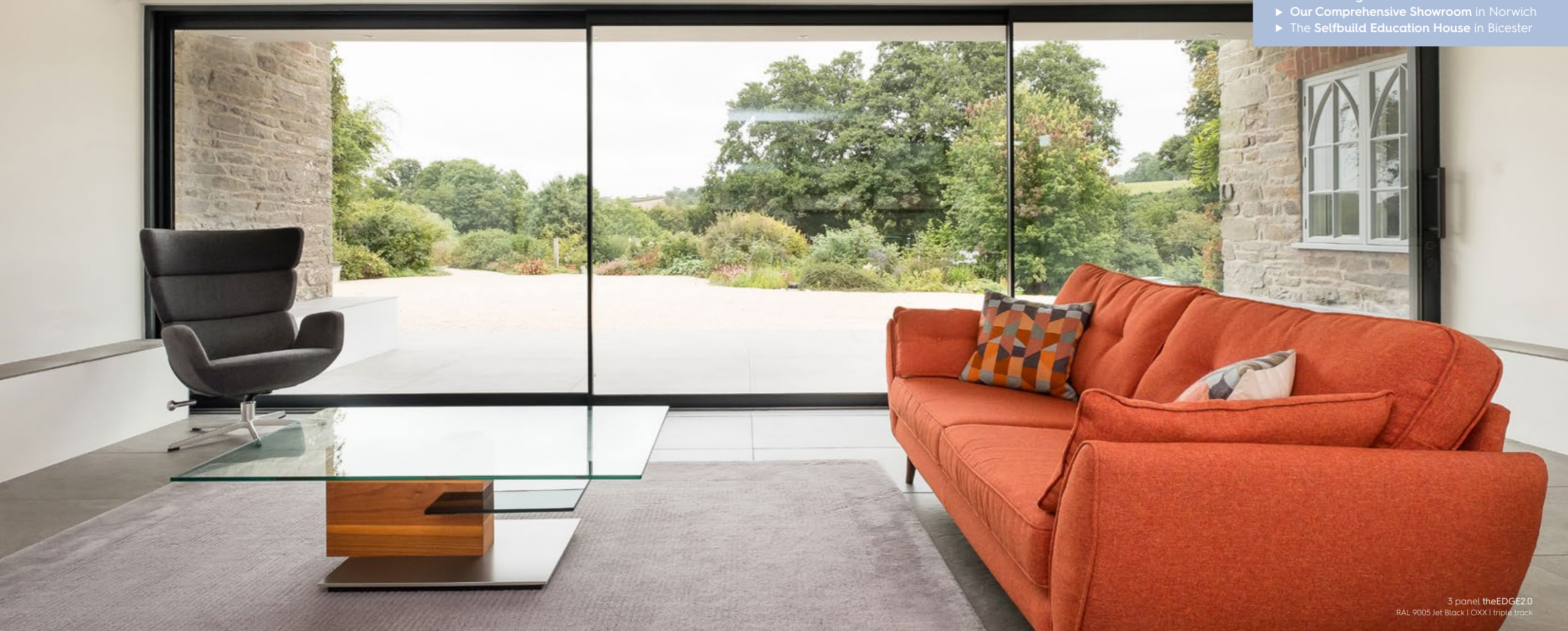
3 panel theEDGE2.0 RAL 9005 Jet Black | OXX | triple track