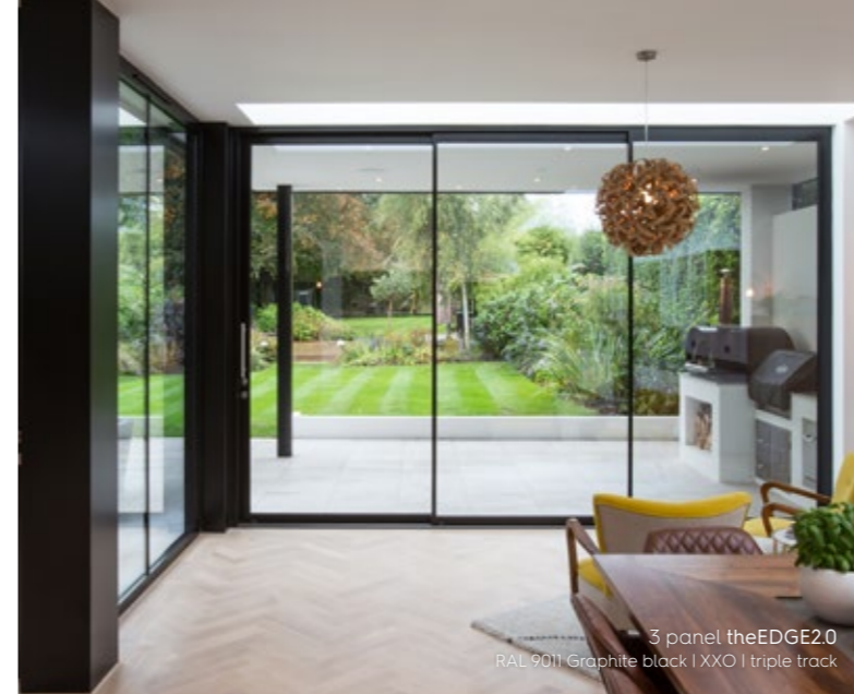
3 panel theEDGE2.0 RAL 9011 Graphite black | XXO | triple track