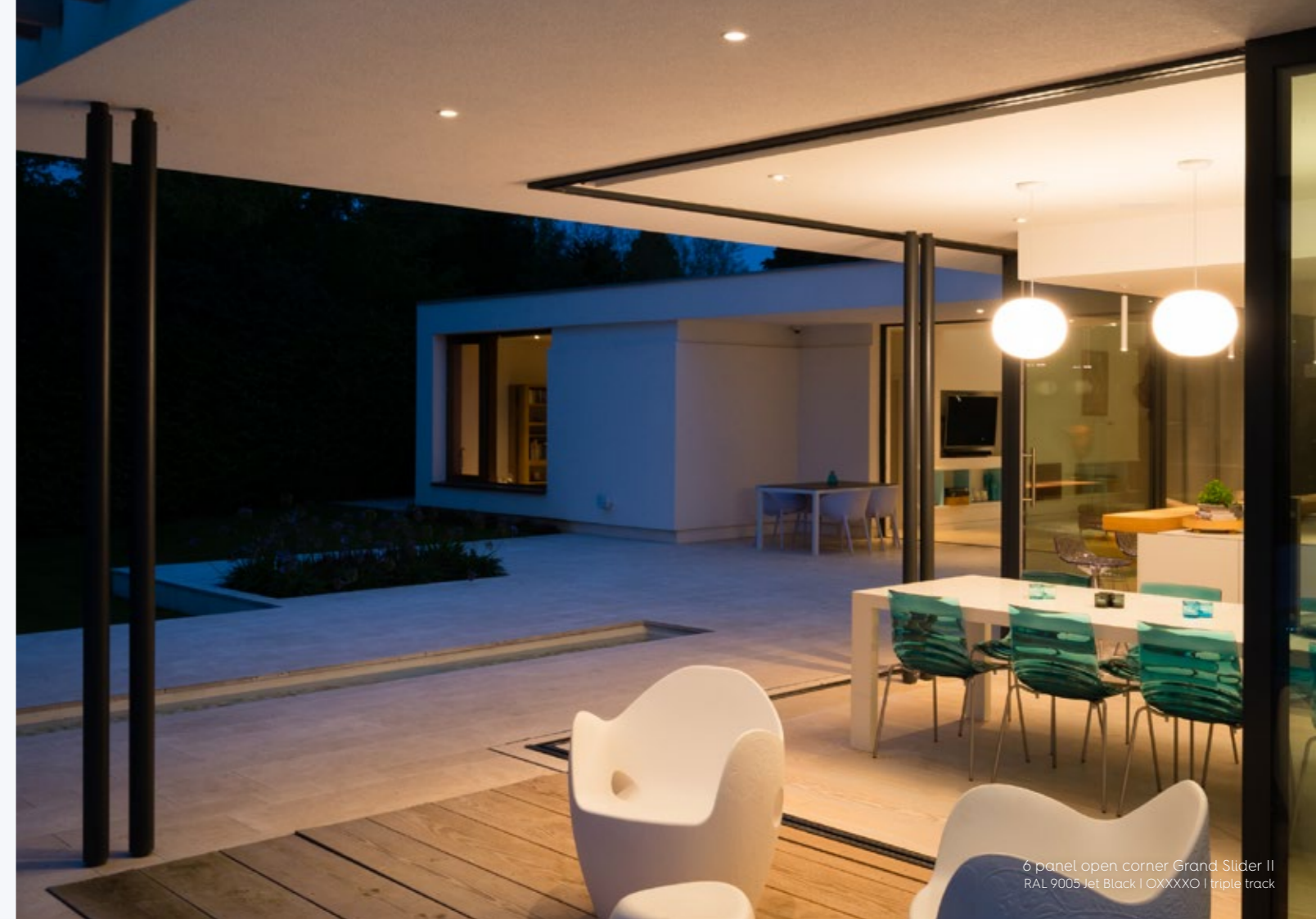
6 panel open corner Grand Slider II RAL 9005 Jet Black | OXXXXO | triple track