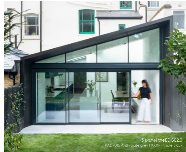
3 panel theEDGE2.0 RAL 7016 Anthracite grey | XXXP | triple track