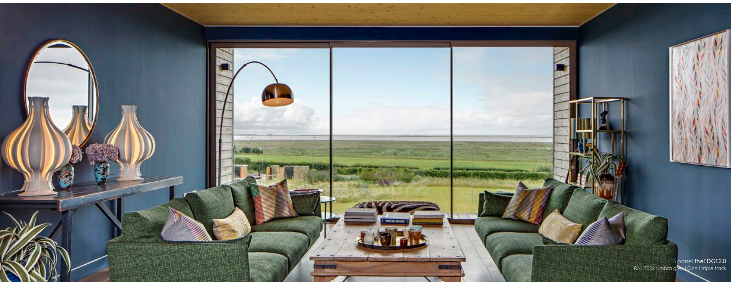
3 panel theEDGE2.0 RAL 7022 Umbra grey | OXX | triple track