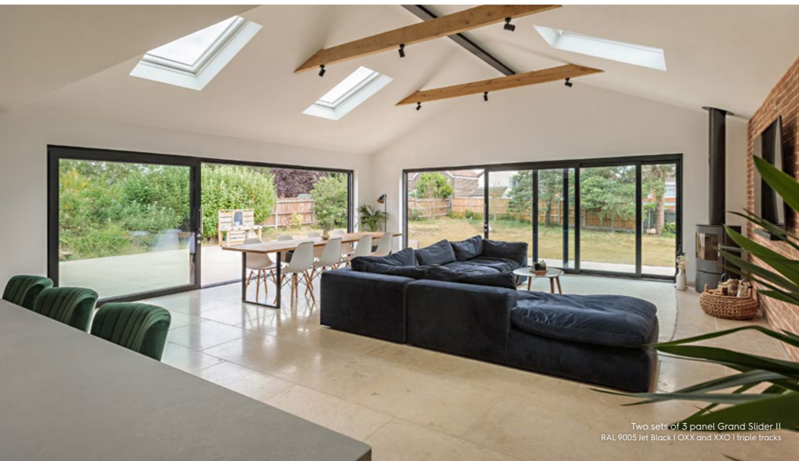
Two sets of 3 panel Grand Slider II RAL 9005 Jet Black | OXX and XXO | triple tracks