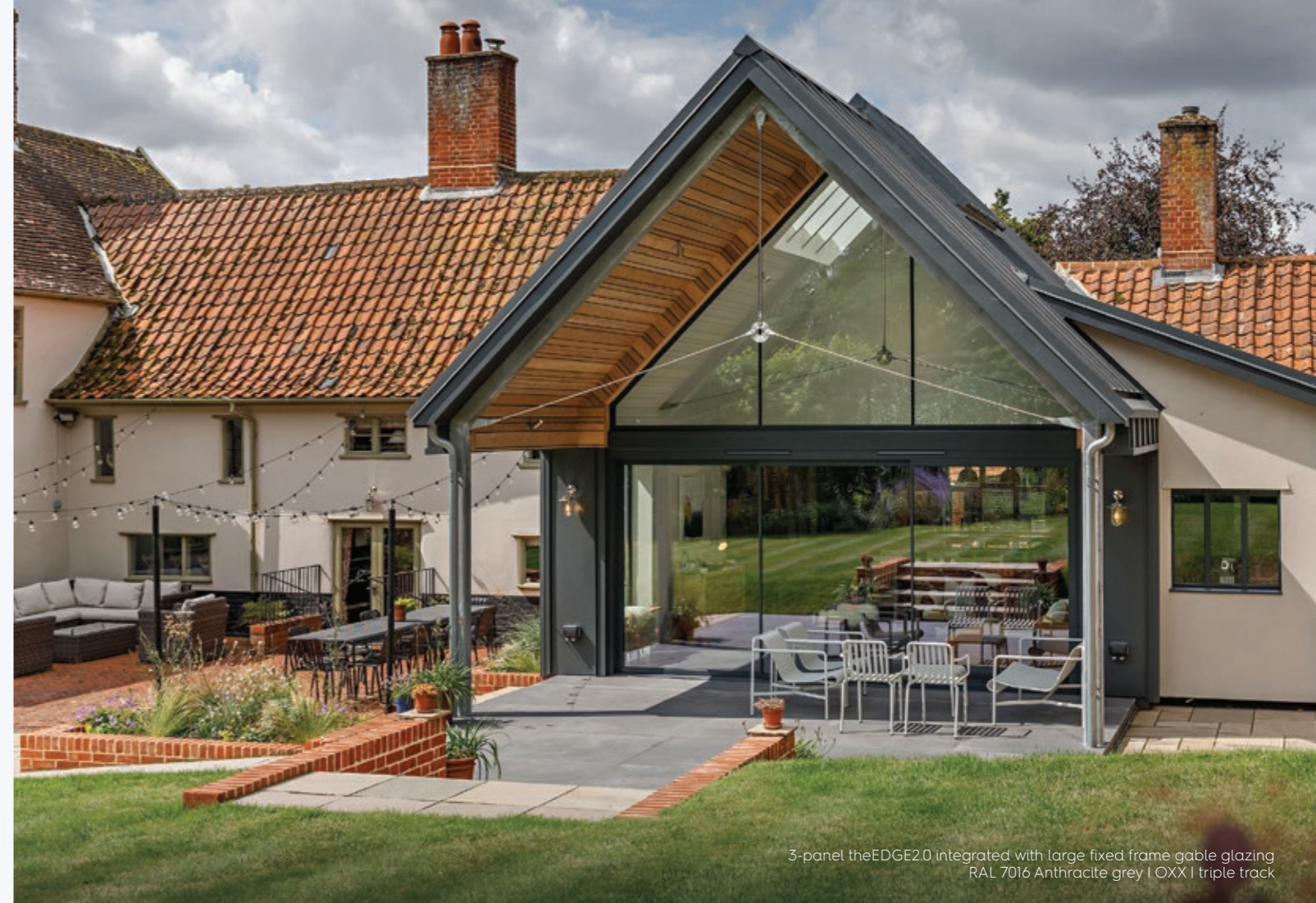
3-panel theEDGE2.0 integrated with large fixed frame gable glazing RAL 7016 Anthracite grey | OXXI triple track

A grab handle recessed into the frame of the panel and used to initially open or close the doors. Available colour-matched to the finish of the doors as standard.