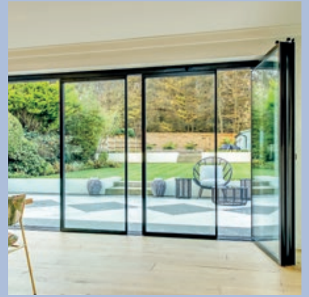
slide & turn doors