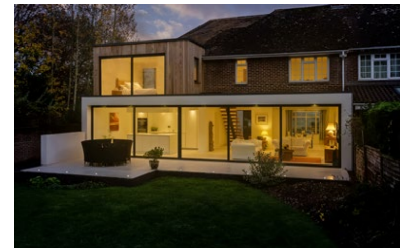
First floor: 2 panel Grand Slider II sliding window RAL 7016 Anthracite Grey | XO | twin track Ground floor: 5 panel Grand Slider II sliding doors RAL 7016 Anthracite Grey | PXXXO | twin track

We offer the widest range of system options, a multitude of configuration layouts and the ability to completely open up corners or slide doors into a pocket behind a wall - all designed and manufactured with the quality you would expect from IDSystems.