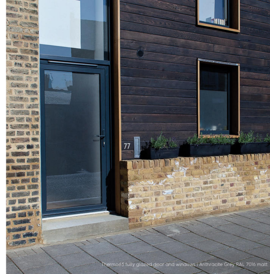
Thermo65 fully glazed door and windows | Anthracite Grey RAL 7016 matt

For larger apertures they can be included as part of our glass curtain walling solution or combined with fixed frame windows to create contemporary glass facades.