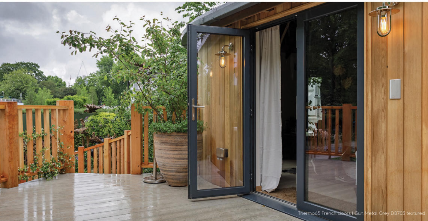
Thermo65 French doors | Gun Metal Grey DB703 textured

The doors are available with a range of glass options including clear, satin or even patterned glass. The doors can be double or triple glazing and can be specified with laminate glass to provide the ultimate in security protection.