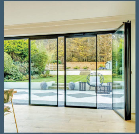
slide & turn doors