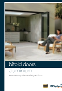
Bifold doors Aluminium