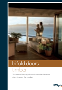
Bifold doors Timber