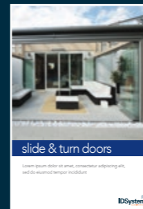
Slide & Turn doors